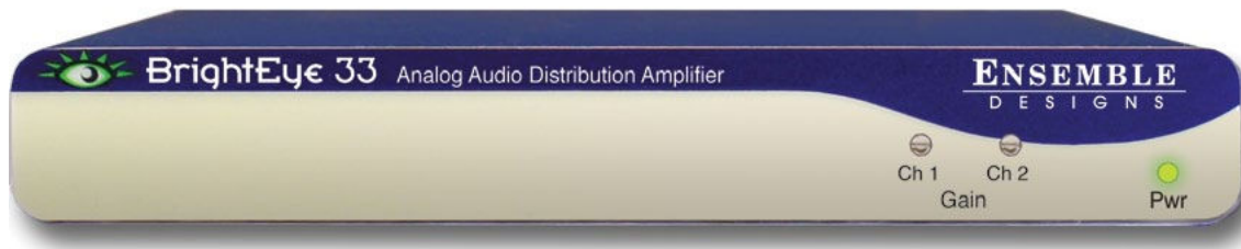
BrightEye 33 Front Panel

Monitoring of the BrightEye 33 is performed from the front panel as illustrated in the figure below. This is a simple device with no interface to the BrightEye Control application. There are no adjustments required for this unit.