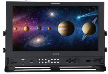
PBM-217-4K Monitor displaying MEDIALAN stream A / Main Loop out 12G SDI from SFP-217-25G