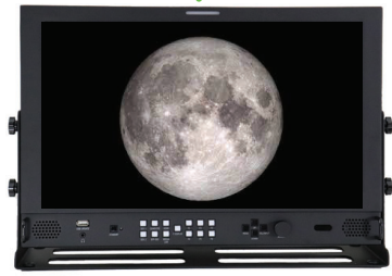
PBM-217-4K Monitor displaying MEDIALAN stream B/AUX output 12G SDI from SFP-217-25G