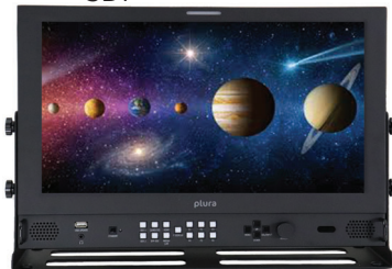
PBM-217-4K Monitor displaying MEDIALAN stream A / Main Loop out 12G SDI from SFP-217-25G-H