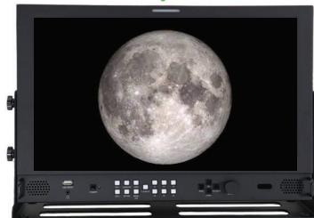
PBM-217-4K Monitor displaying MEDIALAN stream B/AUX output 12G SDI from SFP-217-25G-H