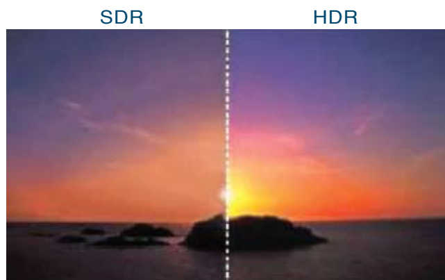
The PBM-4K series offers HDR Display capabilities supporting PQ (ST-2084) & HLG standards. The PBM-4K series allows to display same image side by side with HDR & SDR. This is a great

The PBM-4K series comes in multiple sizes 24", 32", 43", 49", 55", 65" & 84", all sizes offer the extensive and well-know Plura prominent features. PBM-4K Series supports up to 4096 x 2160 resolutions, focuses on delivering the highly detailed, accurate color representation and stunning picture consistency that high-end production applications require. The PBM-4K series offers HDR Display capabilities supporting PQ (ST-2084) & HLG standards.